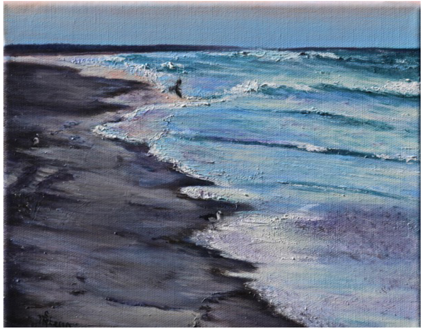
Evening on the Beach Oil on canvas 8" x 10" x 1 1/2"