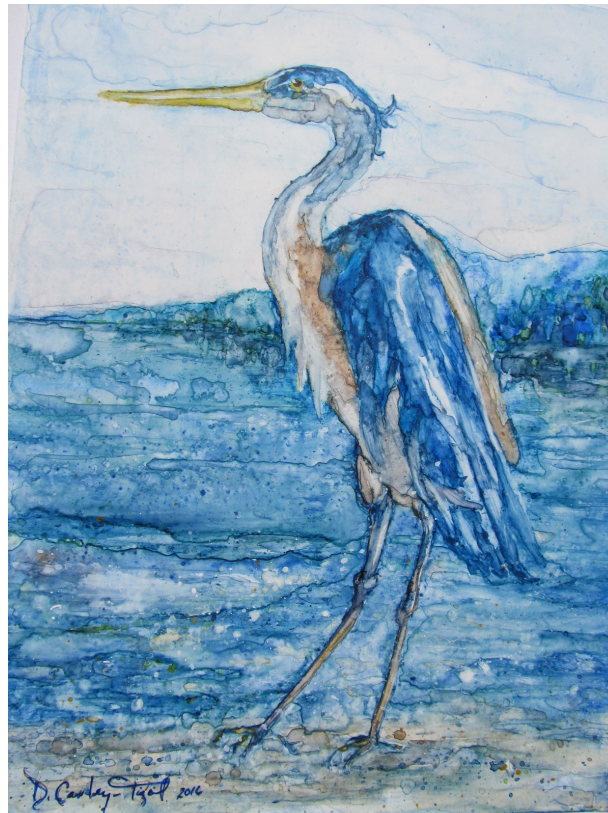
"Heron Blues" 9" x12" Watercolour on Yupo