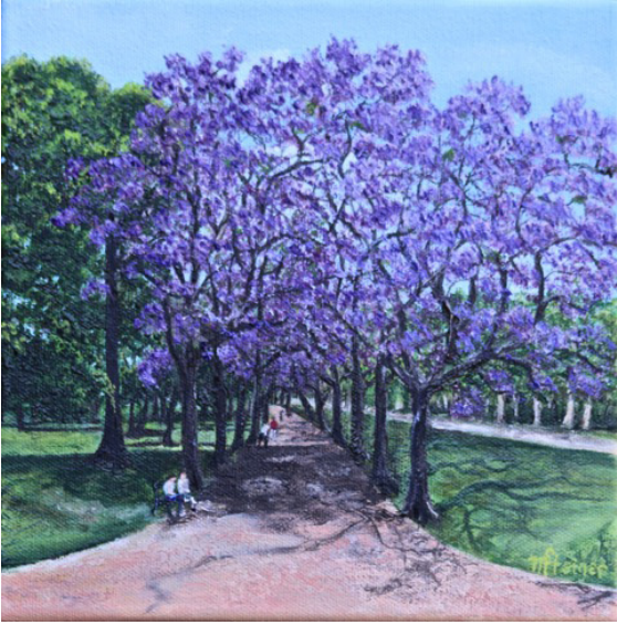
Springtime Oil on canvas 8" x 8" x 1 1/2"